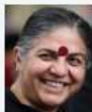
Dr. Vandana Shiva

President, Millennium Institute Founder, Biovision Foundation