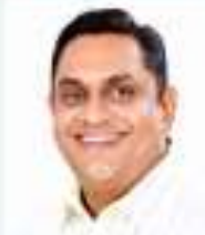
Hon. Shashindra Rajapaksa, M.P.